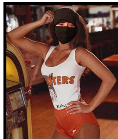
Hooters Opens in Afghanistan! Page 3.