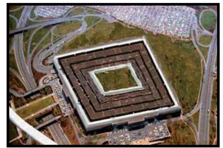
Plans for The Parallelogram, a 20% reduction

Proposals for the Pentagon’s 20% cost reduc-