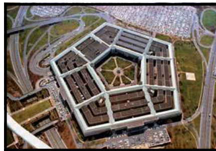
The Pentagon today, with all five sides

Rumsfeld claims that the new building plans will not only meet cost-reduction needs, but will improve military planning. “In this four-directional world one needs to think in four directions, not five. Any building with more than four