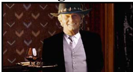
"That's not a lie...this is a lie."

MONTLOUIS-SUR-LOIRE, France—Roughly nine years after Lighting Jack bombed at the box-office, Paul Hogan is mounting the biggest acting comeback since Paul Reubens returned to the public arena as Penguin's Father in Batman Returns . Hogan, a 63-year-old Australian is starring as "The Butler" on Fox's new reality show "Joe Millionaire." Hogan is best known for the 1986 blockbuster Crocodile Dundee , and for his voice-overs in Subaru Outback and Foster's Beer television commercials. (continued on page 3)