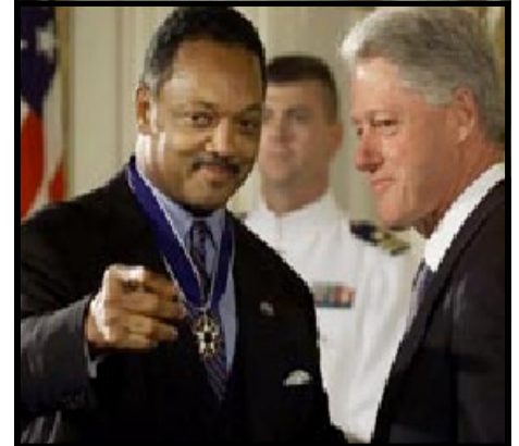
"Look-it, Bill." "Good eye, Reverend."

In preparation for possible future litigation that goes hand in hand with operating a house of sex, Clinton pardoned himself and Jackson of any possible crime. Sources close to the project indicate that recently pardoned financier Marc Rich