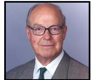
Hans Blix Named New Spokesperson for 7-UP: "The UN-Cola" (top of page 7)