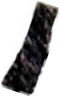
Sideburn of "90210" star, Jason Priestley

Priestley became a teen heartthrob playing Brandon Walsh on "90465" or whatever. The under-achieving actor left the series in 1998 to pursue such blockbuster hits as "Eye of the Beholder," "Calendar Girl," and "Love and Death on Long Island."