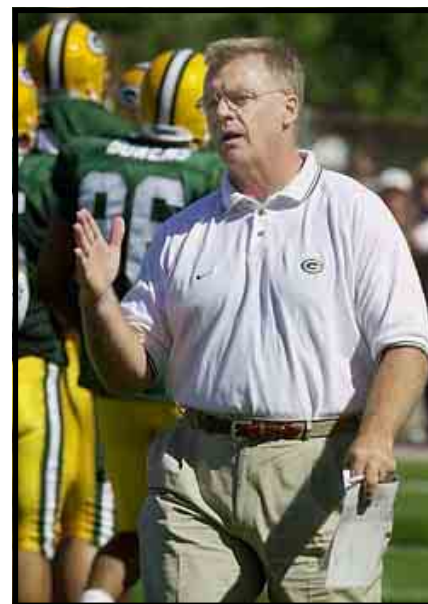
GM/Coach Sherman, 2001