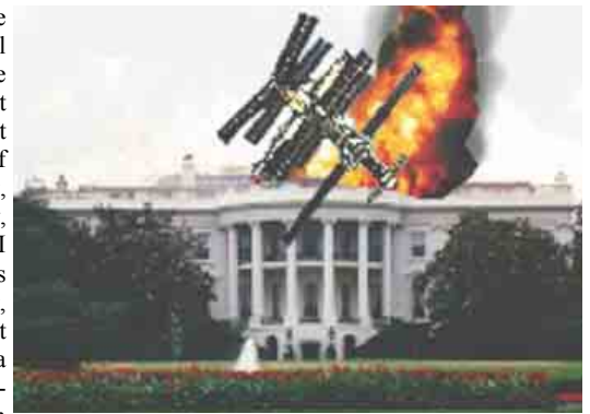
U.S. officials calling Mir "a near miss"

President Bush was home playing SimCity at the time of the Mir crash. "I had the disasters menu on. Dick (Cheney) helped me set up some killer surround sound, so at first I thought I was under an alien invasion. Man, I was right almost. What a cool game," said Bush. The President was unharmed by the incident, but Secret Service officials are reportedly implementing a "crashing Commie crap" standard operating