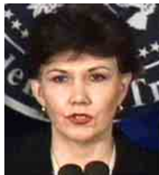
Liberals Crack Down on Compassionate Minority, page 5